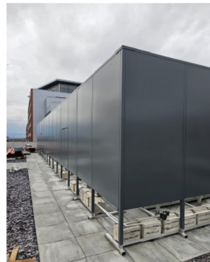
Acoustic Performance ( Rw26dB)